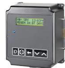
Fleck 3900 3" Brass Valve